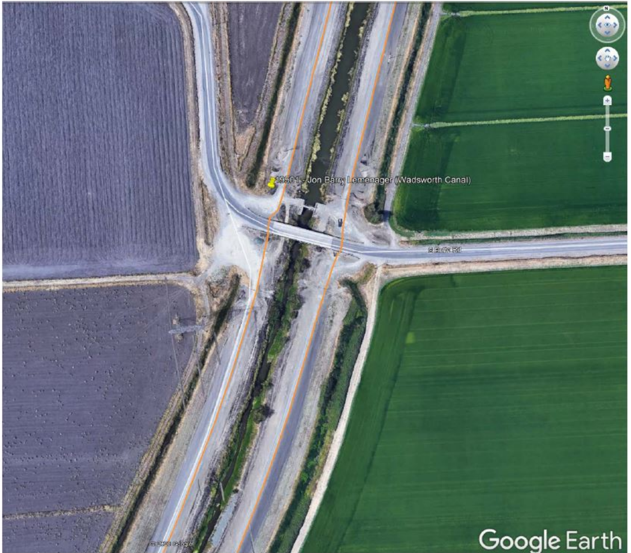
2) Proposed project location map