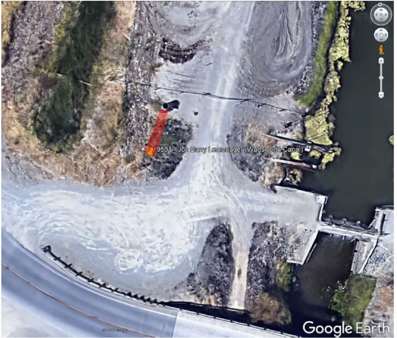
3) Approximate project footprint map